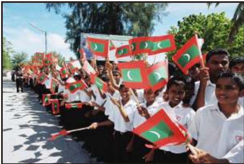
The Maldives is a youthful nation with proud history and cultural identity