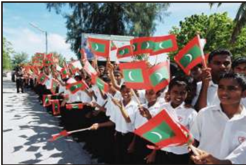
The Maldives is a youthful nation with proud history and cultural identity