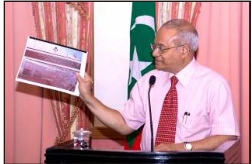
The President launching the Roadmap for the Reform Agenda (27 March 2006)