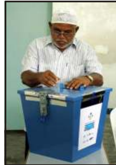
The country's first multiparty elections to be held in July - October 2008