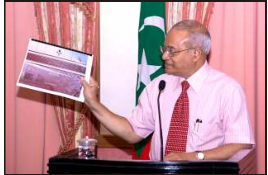
The President launching the Roadmap for the Reform Agenda (27 March 2006)