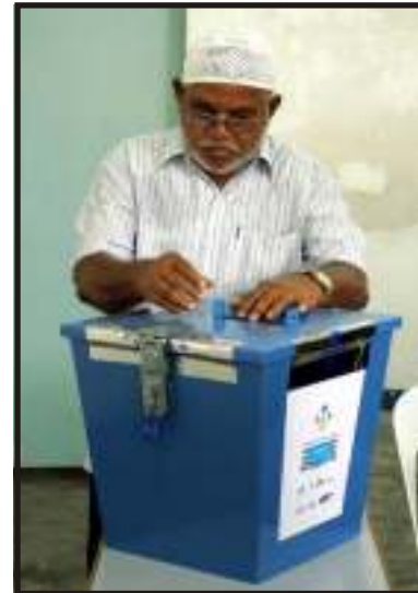
The country's first multiparty elections to be held in July - October 2008