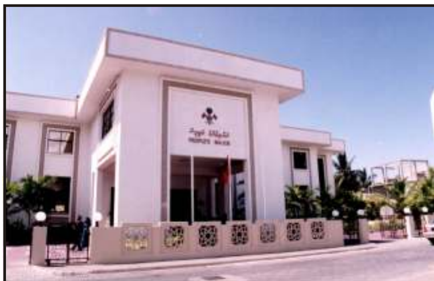
The Parliament - A Pillar of Democracy in the Maldives